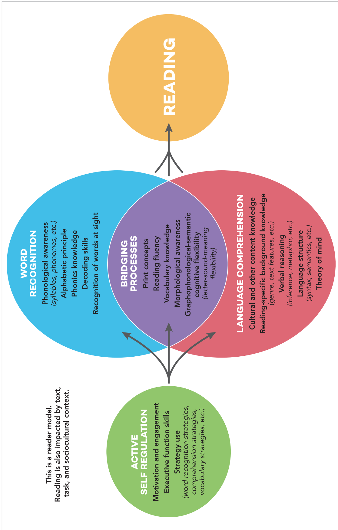
FIGURE 2 The Active View of Reading Model

Note. Several wordings in this model are adapted from Scarborough (2001).